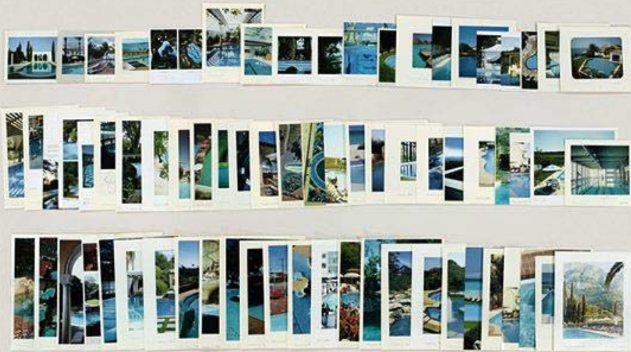
"Folder: Swimming Pools"

JOHN BERGGRUEN GALLERY 228 GRANT AVENUE SAN FRANCISCO CALIFORNIA 94108