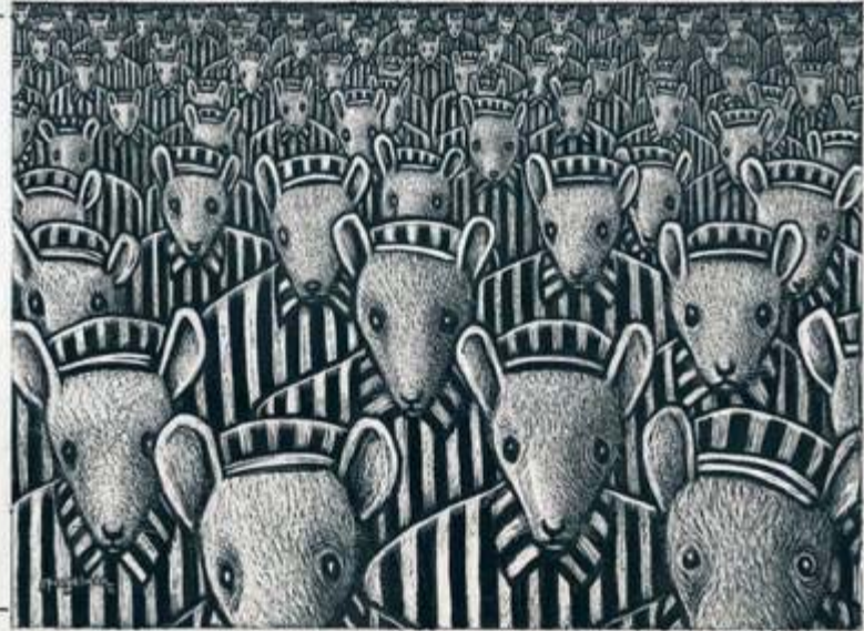
catpaper MHS II